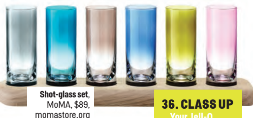
Shot-glass set, MoMA, $89, momastore.org

36. CLASS UP ...Your Jell-O shots, because the only thing that should be served in 3-ounce Dixie cups is Listerine.