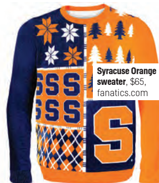
Syracuse Orange sweater, $65, fanatics.com